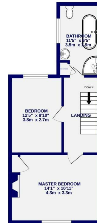
1ST FLOOR 403 sq.ft. (37.4 sq.m.) approx.